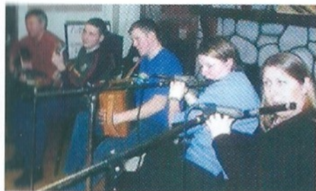
The Full Shilling