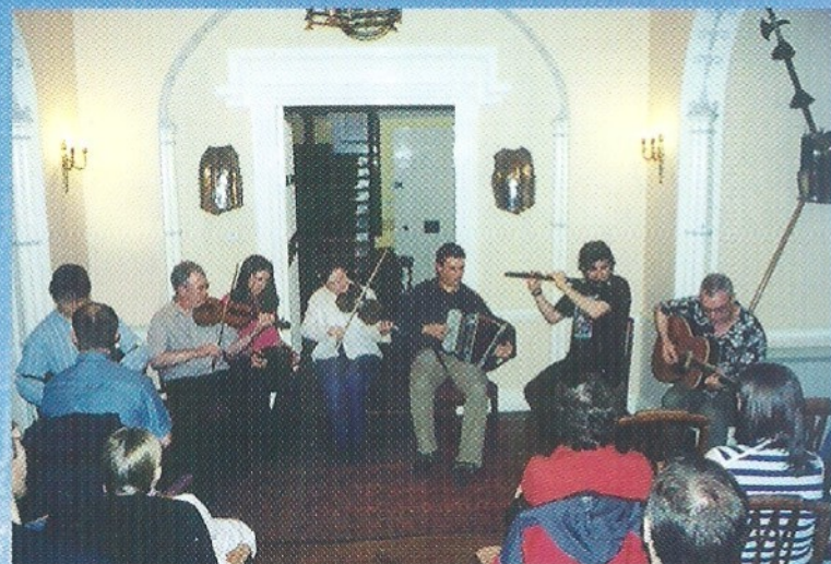
Ardgillan Castle Gala Recital 2003