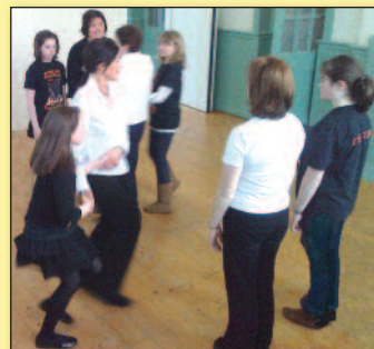
Inis Rua Mother & Daughter Set